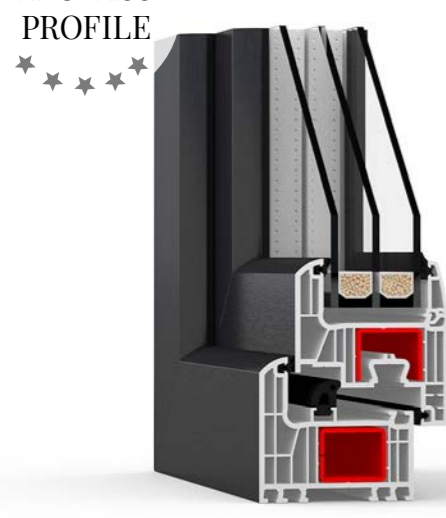
Iglo Energy Classic